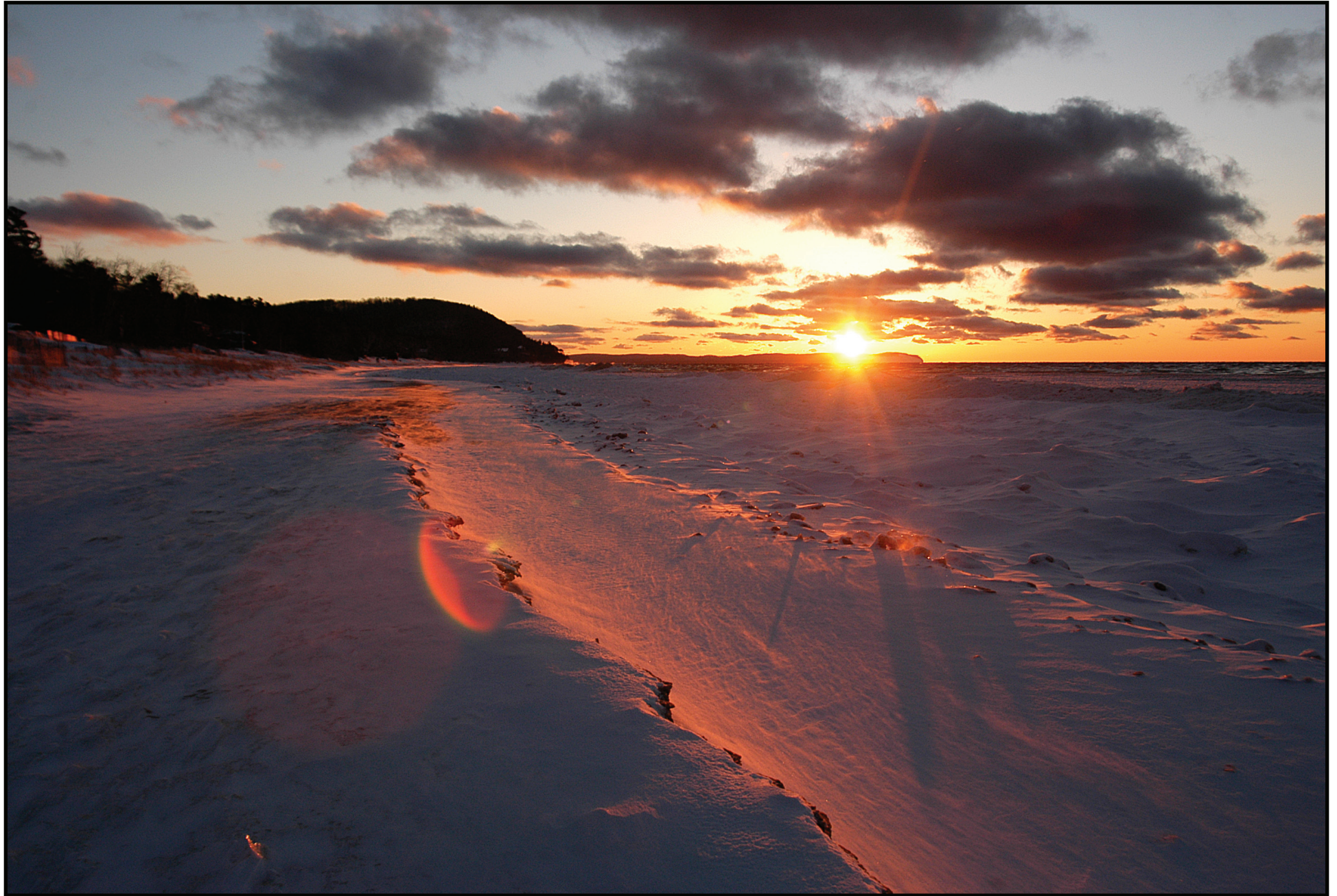
1/24/2008 - Keith Burnham