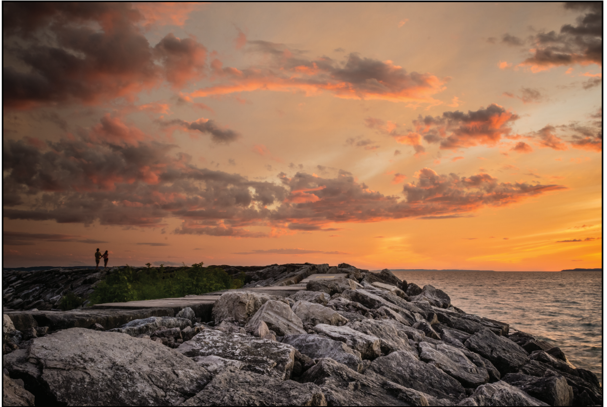
"Two at Sunset" - Unpublished - Jim Burnham