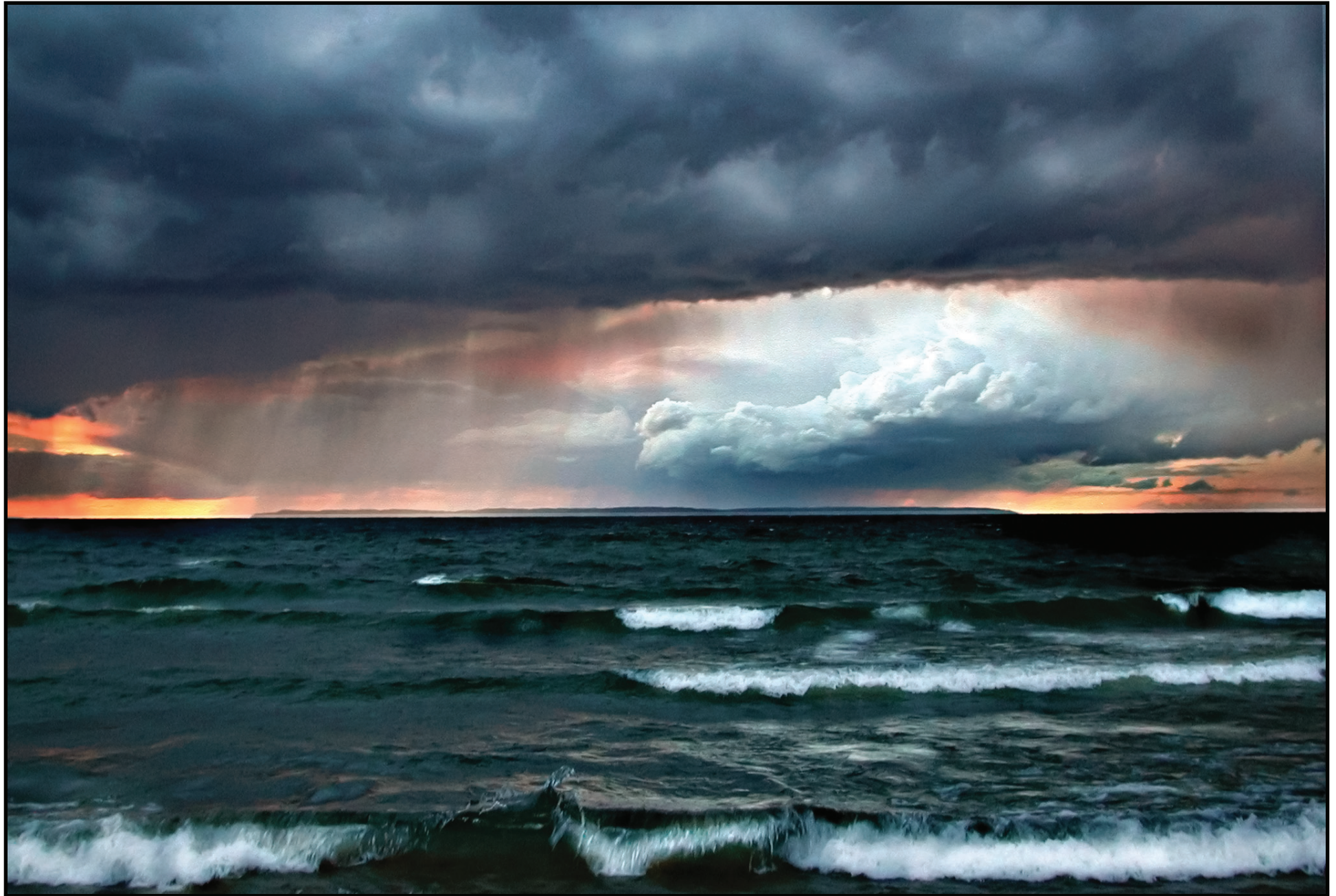
"Manitou Passage Revisited 10 Hours Later" - 9/23/2002 - Keith Burnham