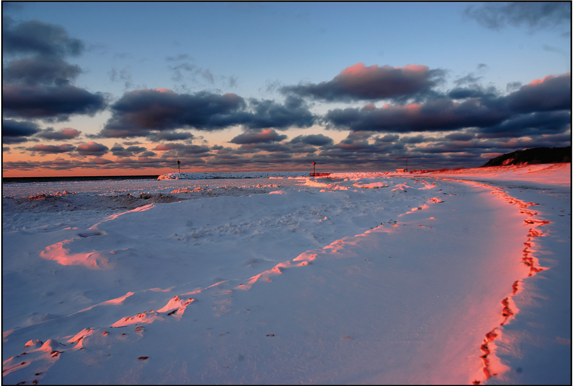
1/24/2008 - Keith Burnham