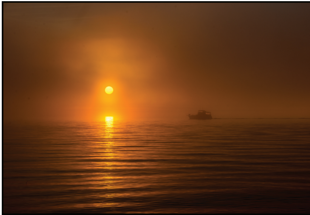
"Harbor Return" - Unpublished - Jim Burnham 2015