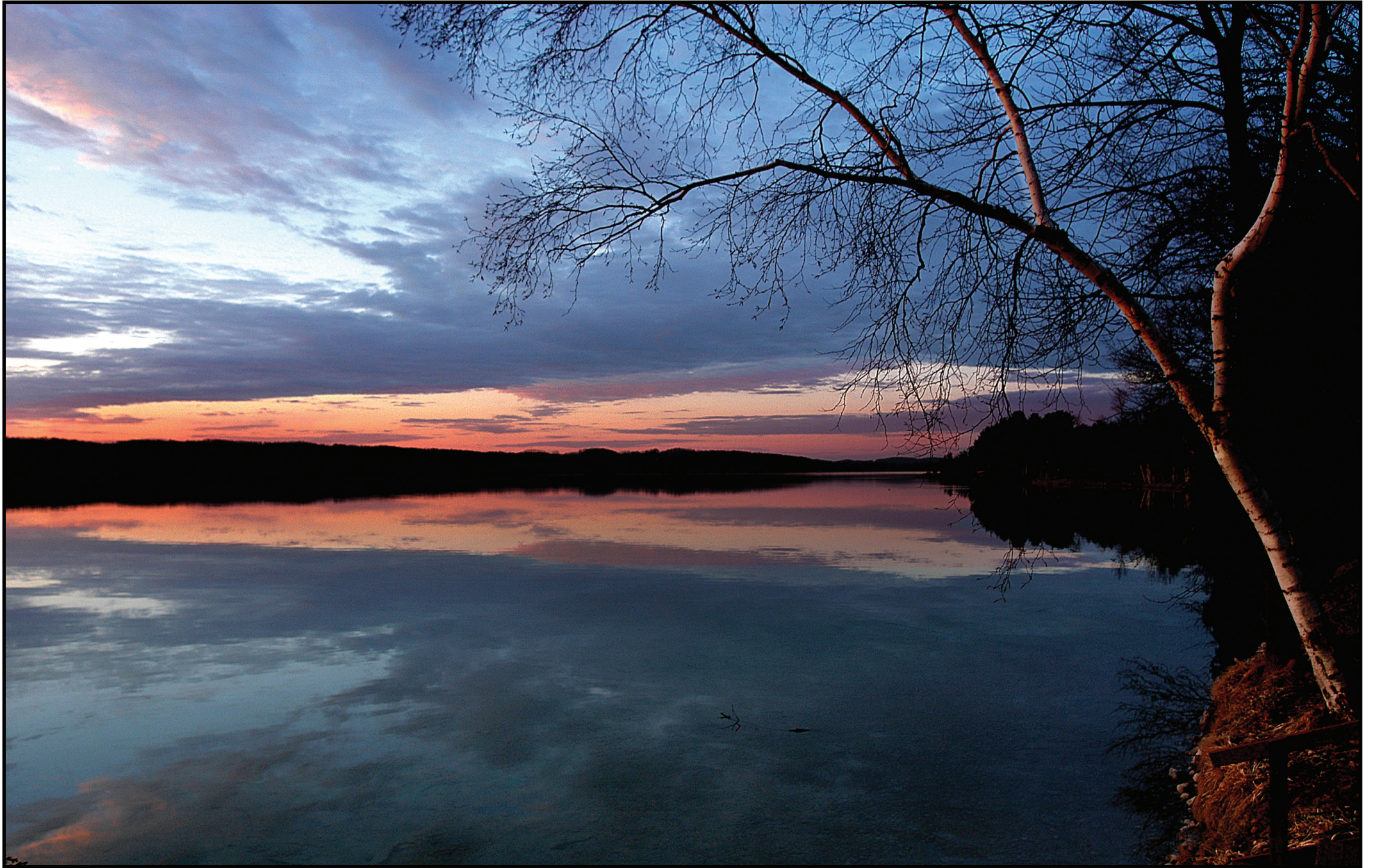
"Morning Inspiration" - 4/6/2006 - Keith Burnham