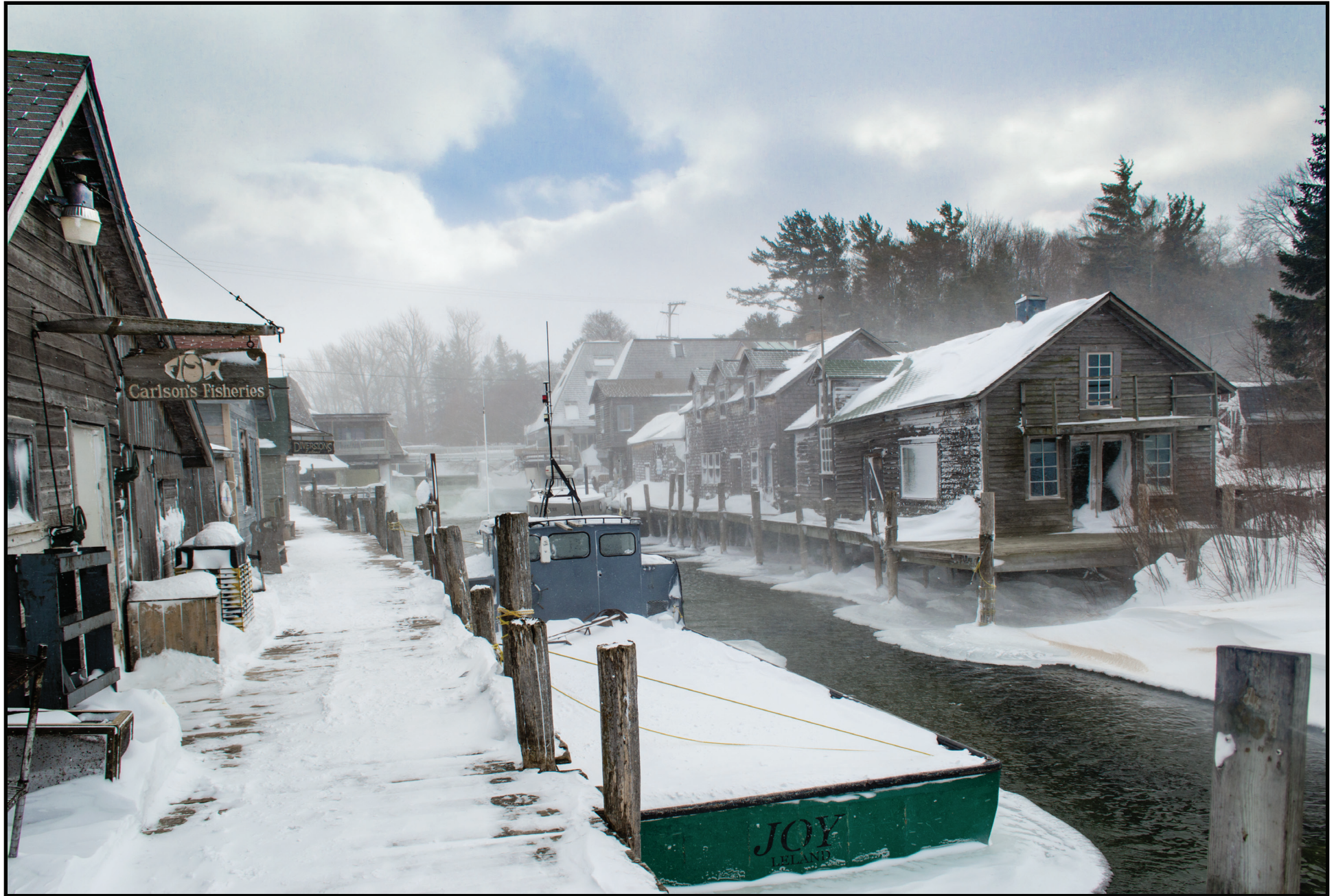
"A Wild and Windy Snow Packed Day" - 1/28/2014 - Keith Burnham