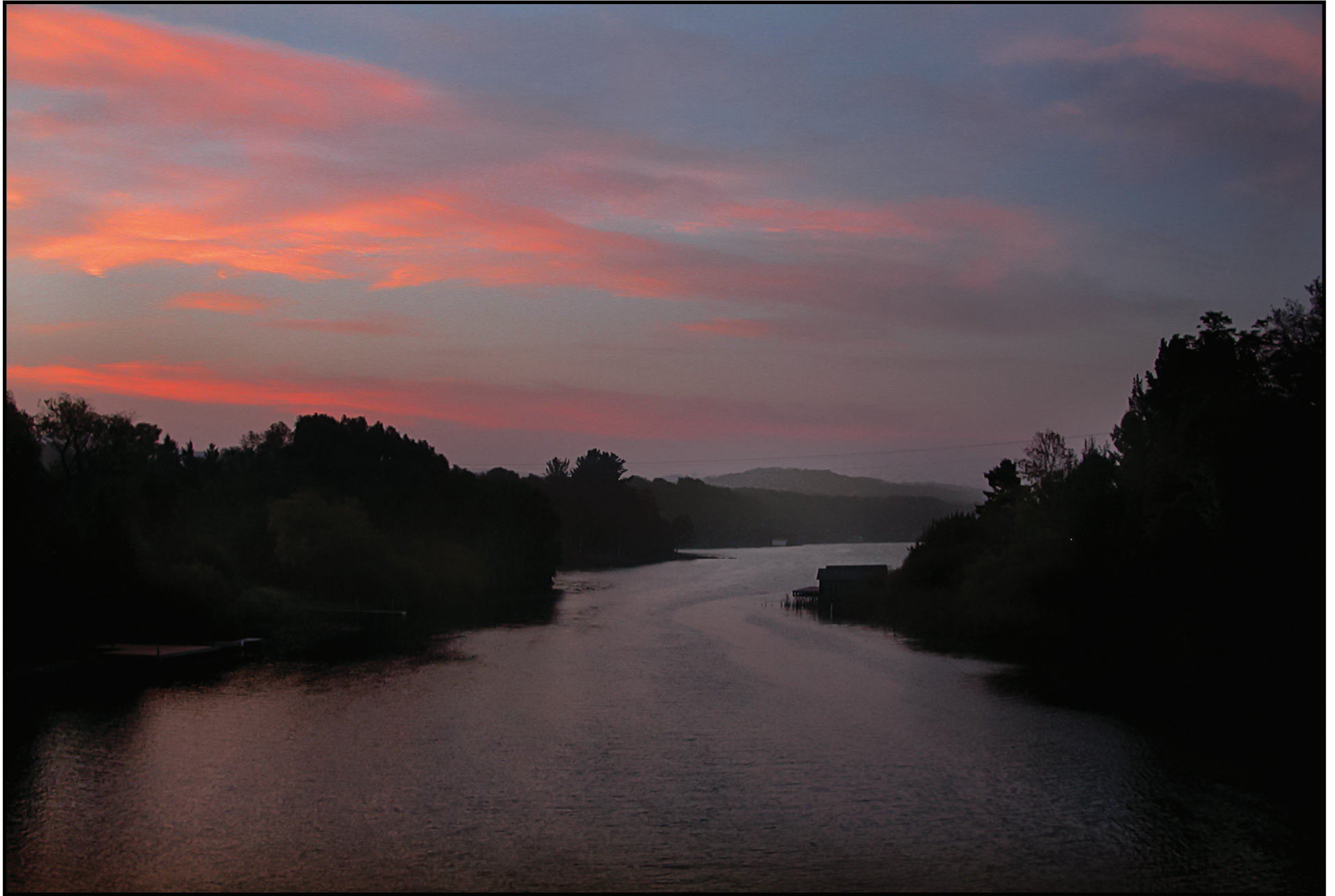
"Predawn Sky Over the Narrows" - 10/12/2002 - Keith Burnham