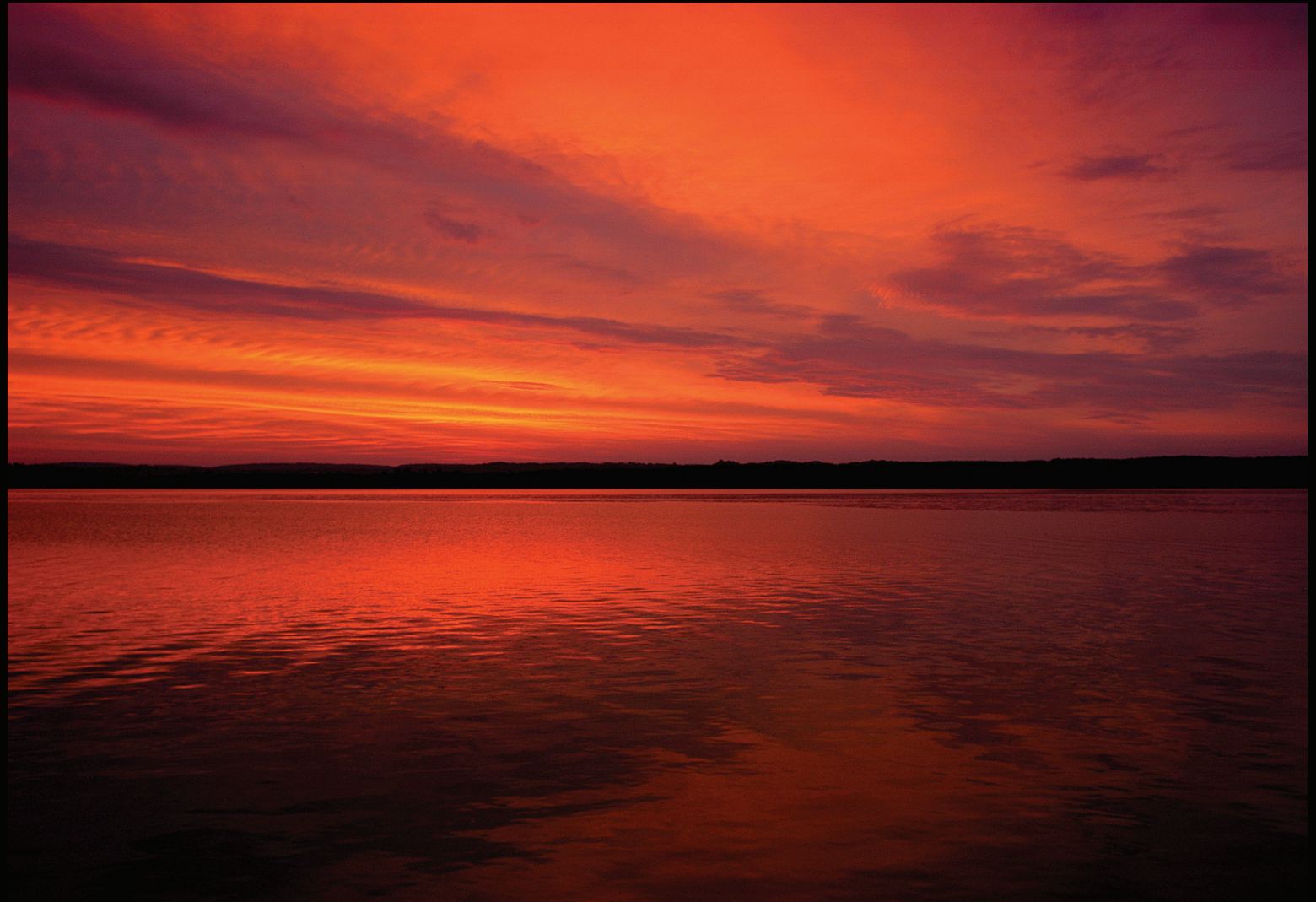
"Fire in the Sky" - 9/19/2005 - Keith Burnham